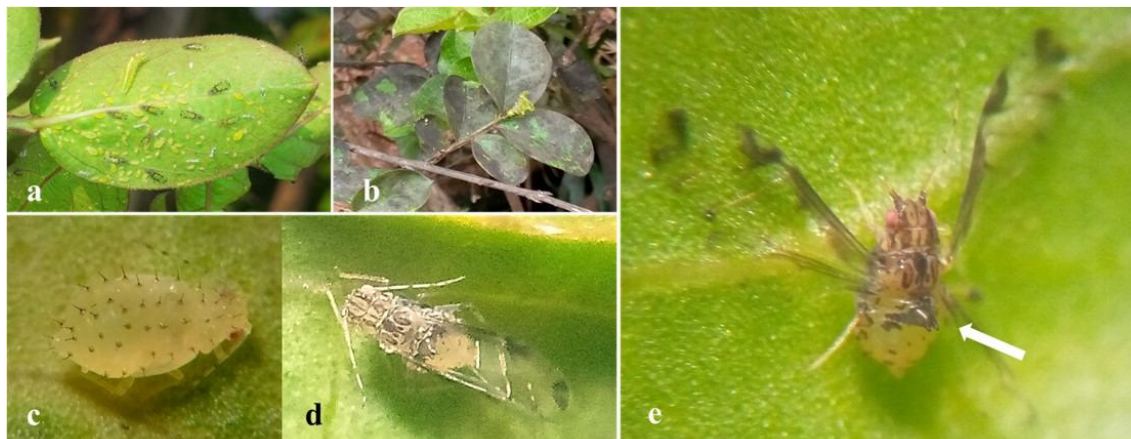
Figure 1. Tinocallis kahawaluokalani observed in Gabon : heavy infestation of the CMA on a young leaf of Largestroemia indica showing a green syrphid larva (a), upper side of leaves covered with black sooty mold growing of aphid honeydew (b), nymph (c) and adult (d), typical tubercules on abdomen (e).

The earliest aphid samples were collected with the help of fine paintbrush and preserved in 70% ethyl alcohol in 15ml glass vials for later identification at laboratories, as well for some larvae or adults of natural enemies kept in rearing plastic boxes on twigs bearing their preys (CMA). To confirm the field direct identification, the collected insects (CMA and predators) from Franceville, Lambarene, Mitzic and Mouila were brought at the Crop Plants Protection Laboratory (CPPL) of the Institut National Supérieur d'Agronomie et Biotechnologies (INSAB) from the University of Sciences and Technologies of Masuku (USTM) (Haut-Ogooué Province), whereas those collected from Libreville were analyzed at the Institut des Recherches Agronomiques et Forestières (IRAF) from the Centre National de la Recherche Scientifique et Technologique (CNAREST) (Estuaire Province).