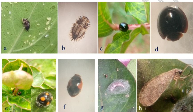
Figure 3. Coccinellid and Hemrobid predators: Chilochorus nigritus ( a : larva, b : nymph, c : adulte on twig , d : 3.5x magnifying adult), Platynaspis capicola ( e : minute and 5x magnifying adult), Scymnus interruptus ( f : adult), Micromus sp. (g: nymp, h: adult)