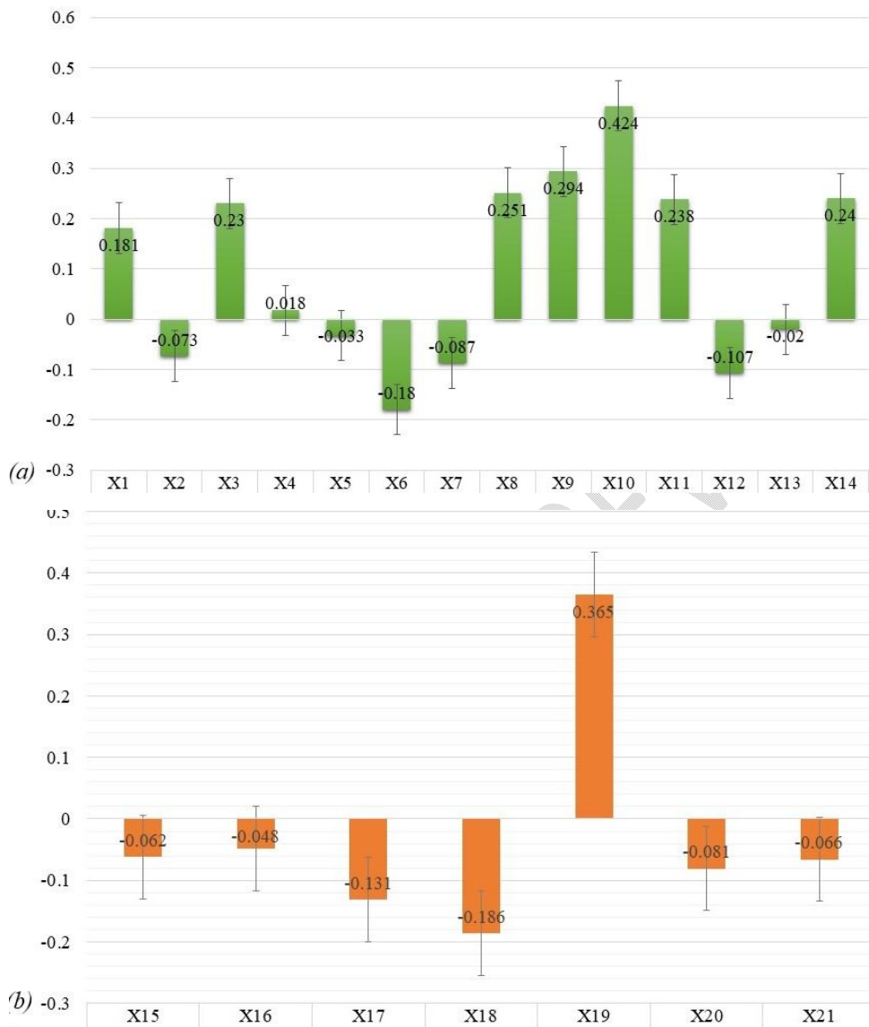
Fig. 3. The correlation coefficient ( r ) of farmers' knowledge level ( y ) with all independent variables ( x_1 - x_{21} ) are presented in graphical models. a) the independent socio-personal variables ( x_1 - x_{14} ), and b) management variables ( x_{15} - x_{21} ) were analyzed with the dependent variable ( y ) using correlation coefficient. The column bar indicates the deviation errors.