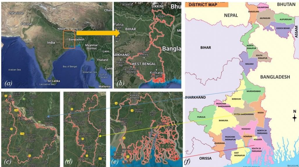
Fig. 1. Google map showing the conducted study area of; a) India, national-level view, b) West Bengal, state-level view, c) Administrative district area of Murshidabad, d) district Nadia, e) district South 24 Parganas, and f) district map of West Bengal.