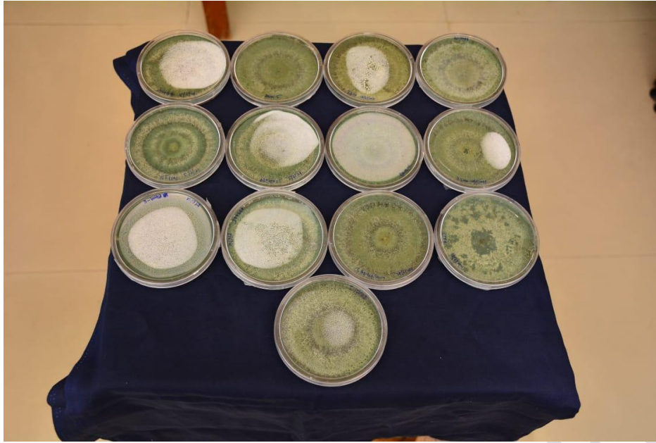
Figure 2 : Trichoderma spp. isolates in petriplate incubated at 28 \pm 2^\circ\text{C} after 5 days incubation

2.3 Method for Isolation of Trichoderma (In-Vitro) –For isolation of fungi Trichoderma , pure culture is bought from IMTECH lab , Chandigarh with MTCC no. 793. The growth of pure culture of Trichoderma has been screened on culture media PDA for easy identification of Trichoderma spores .The mediums used is Nutrient media i.e. Potato Dextrose Agar (extract from 250g of potato boiled and filtered, dextrose 20g, agar 15g and distilled water 1000ml)