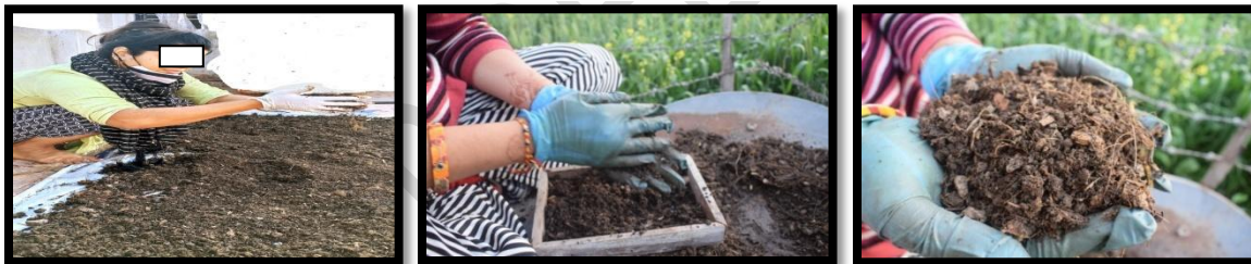
Figure 3 : Tricho- compost material after 30 days

Procedure - Now Trichoderma inoculum mixed with 0.5 kg of compost ( mix up of above listed material) with 2 liter of water . All these ingredients are well mixed together and then placed in the compost bin. Carefully note that the compost and inoculum was mixed up properly before being placed in the compost bin. The compost bin is kept covered for 30 days at a cool place with temperature 25-32° C , so all materials get mixed up and fermented easily. After 30 days , Tricho- compost is ready to applied as a manure in fields. Tricho- compost is applied at a rate of 2 to 2.5 tons/hectare to the crop field for better results.