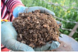
Figure 2 : Use of Trichoderma as tricho- compost material

Results and Discussion – Trichoderma , is a beneficial fungi, as it worked over many plant pathogenic fungi. It worked as antagonistic fungi over soil borne fungal diseases. The identification of the fungal species is based on morphological characteristics of the colony and microscopic examinations (Diba et al., 2007) . Morphological observations were recorded from cultures grown on PDA plates. The Mycelium discs are 5 mm in thickness . Petri plates containing PDA media and incubated at 28 \pm 2^{\circ}\text{C} for one week in BOD. The radius of fungal colonial was measured about 22 mm in thickness. Some characters i.e. colony appearance , presence of pigments, green conidia, odour are also seen and recorded for further references.