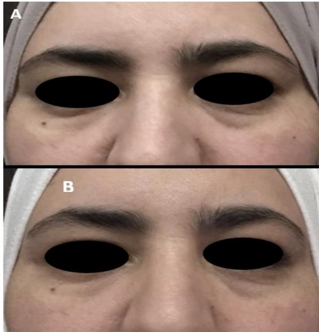
Figure 1: (A): Before treatment with plasma gel injection. (B): After 3 months from treatment, showing good improvement

39-years old female with TTD before treatment with plasma gel injection. And after 3 months from treatment, showing good improvement. Figure 1