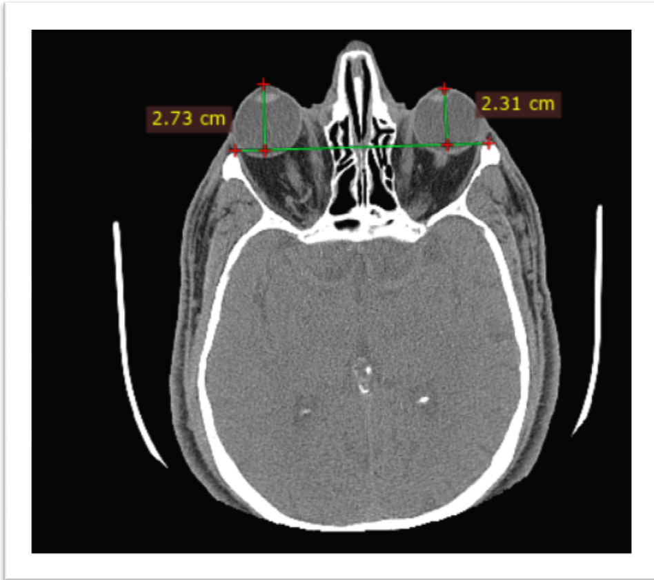
Figure 3 :amount of proptosis in patient with TED,right eye:27.3mm,left eye :23.1mm