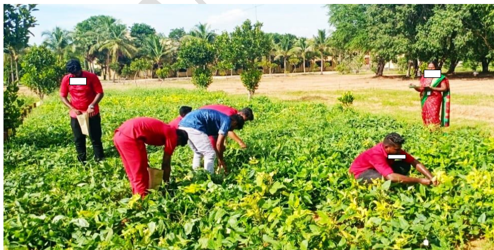
Plate 1. Field trials of blackgram genotypes against yellow mosaic disease