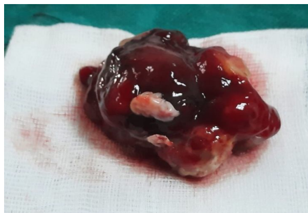
Figure 3: Myxoma of the heart constituted of friable, gelatinous tissue