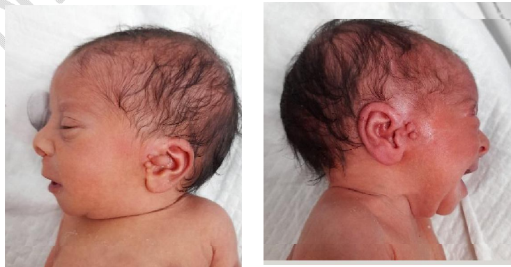
Figure 2: Bilateral preauricular skin tags