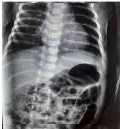
Figure 3: Standard X-ray of the spine. No anomalies found

Chest X ray showed normal cardiac size, lung fields and Spine (Figure 3). TORCH profiles were negative. The Constitutional Karyotype showed the presence of an extra X chromosome in all the mitoses examined (Figure 4). So we concluded the diagnosis of Triple X syndrome.