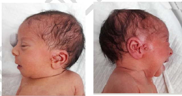
Figure 2: Bilateral preauricular tubers

On physical examination, the palate is intact, the eyeball appears normal, no abnormality in the spine, no orthopedic abnormality visible, the external genitalia of female types without particularities, the cardiovascular and abdominal examination is without particularity. The evaluation of the function of vision has not been concluded. Based on routine blood results, leukocytes 10,610/uL, hemoglobin 19 g/dL, platelets 189,000/uL, neutrophils 35%, lymphocytes 48.1%, monocytes 16%, therefore it was concluded that there was no sign of acute infection.