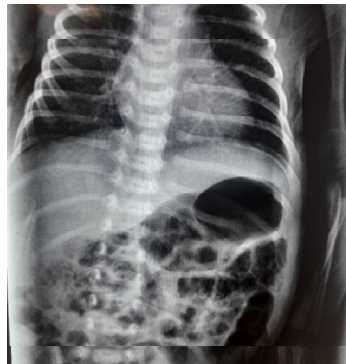
Figure 3: Standard X-ray of the spine. No anomalies found