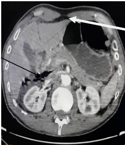
Fig 1 : Abdominal CT scan image showing pneumoperitoneum and a peritoneal fluid effusion.