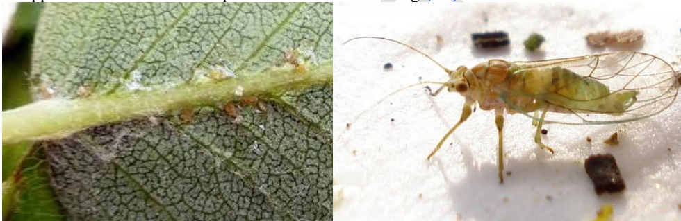
Fig 17 Persimmon psylla ( Triozadiospyri )

The main pest of leaves is the persimmon psylla, which attacks freshly emerging leaves in the spring. Crinkled and deformed leaves indicate an infestation. Control is challenging since the black-bodied adults and white-powder-covered nymphs are found eating inside the deformed leaves. Psylla infestations prevent young trees' shoots from growing normally. It is best to timing the application of conventional pesticides to the bloom stage[49].