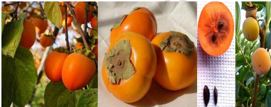
Fig 1. Morphology of fruits

Keywords: deciduous, health, nutritional, varietal, persimmon