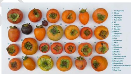
Fig. 3 Leading cultivar of D. virginiana

Comment [R19]: is this cultivar or cultivars?