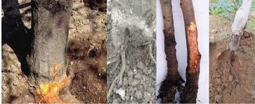
Fig. 11 Root rot disease