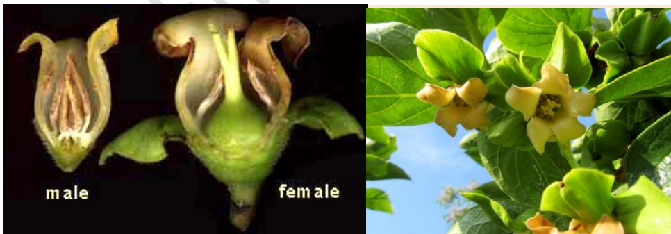
Fig .8 Orchard Floor Management

Comment [R112]: Please indicate the geographical area to which reference is made.