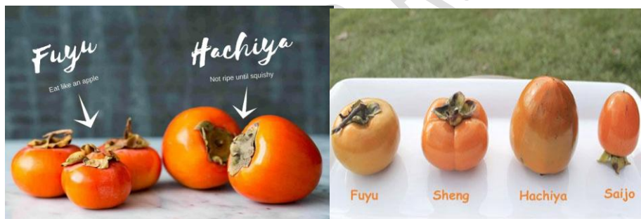
Fig.2 Plant Genetic Resource Management and Varieties

Persimmons can be divided into two groups: astringent and non-astringent. Sometimes, all astringent fruits are referred to as "Hachiya," whereas all non-astringent fruits are referred to as "Fuyu."