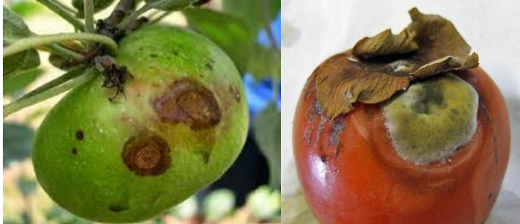
Fig 14Bitter rot disease

Spot also appears on the surface of fruit and foliage. Additionally, it may cause the early loss of leaves and fruits. It could spread via infected areas. Continual rain, temperatures between 28 and 30 °C, and excessive humidity encourage the growth of disease.