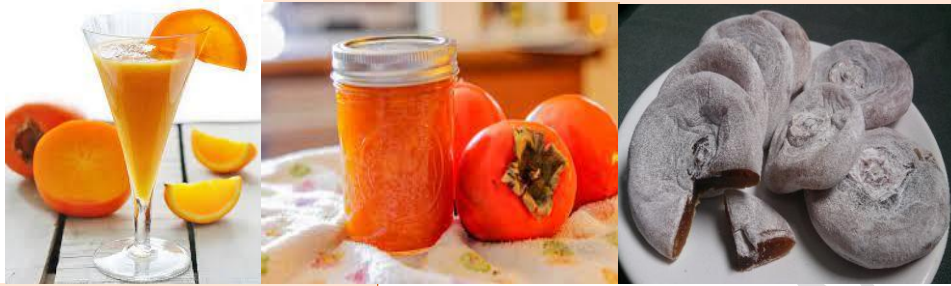
Fig 19 Flowering, Fruiting and Yield

Comment [R127]: Please change the name of the figure, it does not match the images.