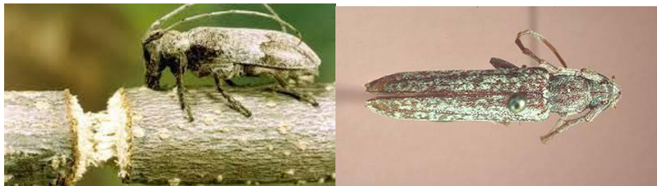
Fig 18 Persimmon clearwing borer ( Sanninauroceriformis Walker)

oviposition, which may eventually fall to the ground. The beetle may spread the wilt illness Cephalosporiumdiосpyri in this way. Twigs that are infested need to be collected and removed[51].