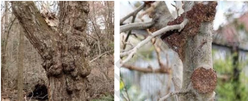
Fig. 10 Crown gall disease

Disease signs observed around the crown, huge galls (swellings) form, and the bigger roots grow smaller marble-sized galls. Plants get infected by bacteria through wounds in the soil. The plant will turn yellow, grow stunted, and sickly if the condition worsens. Infected crop debris and the soil both harbor bacterial life. Warm temperatures and high humidity encourage the growth of illness.