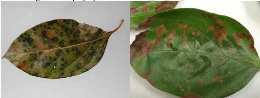
Fig. 12 Cercospora leaf spot disease