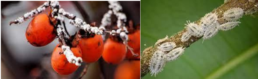
Fig 16 Pest Management