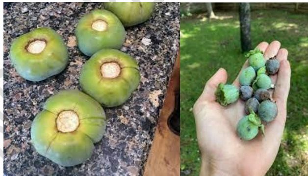
Fig .9 Kaki fruit

Kaki fruit physiological decline is divided into two groups: early drop, which happens from anthesis to early July, and late drop, which happens from mid-August to September. In the first drop, there are two waves. The most serious harm is caused by the first drop-wave, which happens between 10 and 20 days after anthesis. Early in July, the second drop-wave appears. Astringent persimmons experience the late drop more severely than sweet persimmons, notably in Hachiya, Hiratanenashi, and Yokono. In warm areas with little day-to-night temperature variation, the late drop also gets worse[41].