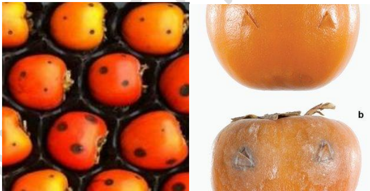
Fig 15 Post harvest fruit rot disease

The fruit calyx (stem-end) was the principal site for the disease's irregular brownish, soft lesions, which spread quickly at room temperature before turning dark brown or black and forming obvious, and occasionally numerous, white to grey mycelium. spreading through fruit that is infected. Fruits are subject to chilling harm, temperature changes, and long-term storage[47].