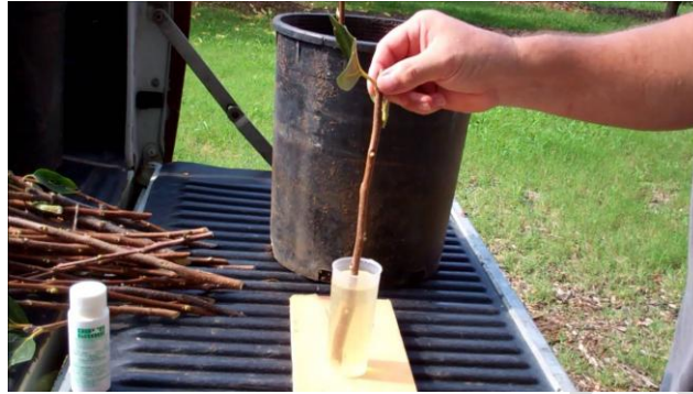
Fig. 4 Stem cutting method