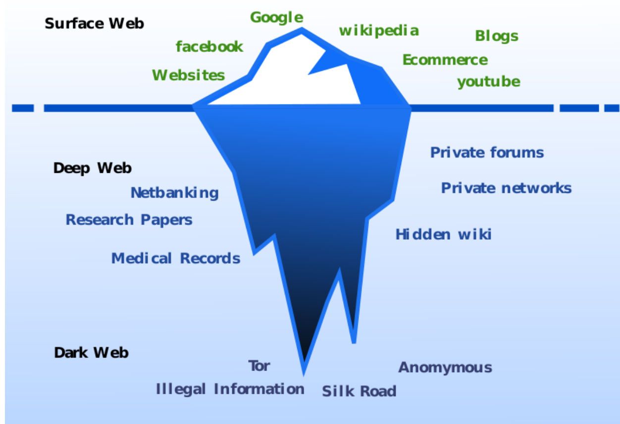
Figure 1 Dark Web Vs Surface Web Vs Deep Web

It is believed that there is something fishy about the traffic that is heading into the darkness. It is possible for it to be malicious, but it is also possible for it to be a misconfiguration. The monitoring systems can be set up in darknets in such a way as to attract potential attackers so that intelligence can be gathered from them. The intelligence of botnets [3, 4] and malware ([5] is frequently lacking. Sadly, some individuals will resort to unethical practices in order to boost both their link count and their reputation, such as the dissemination of fake news through the use of texts, images, and videos [6].