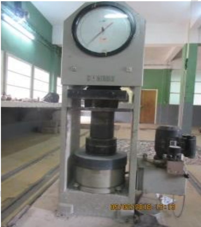
Figure 1. Image of the machine « Controls Milano Itali»

In general, whether it was a raw or granulated paving stone, the test involved sizing the paving stone, weighing it, determining its density, compressing the paving stone, observing its reaction (from the initiation of compression to rupture), and recording the maximum load observed at the point of break on the pressure gauge of the Controls Milano Italia brand "compression press" device, as illustrated in Figure 1.