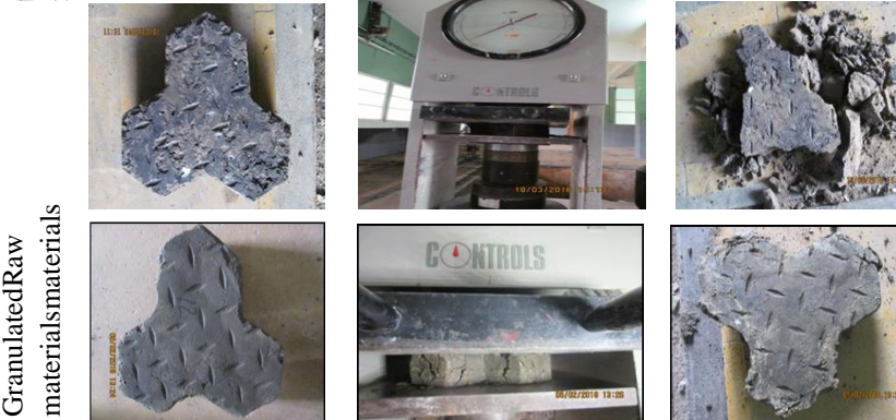
Figure 2. Reaction of paving stones subjected to the resistance test according to the quality of the materials