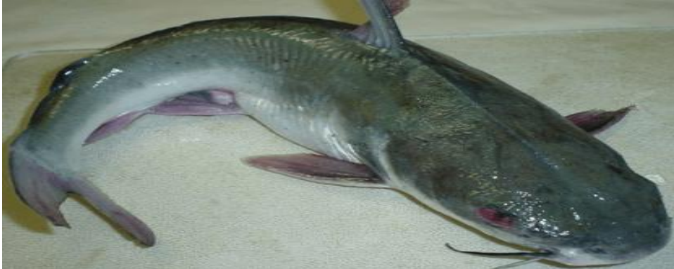
Pic 1: Catfish : Arius heudelotii Source: New Calabar River