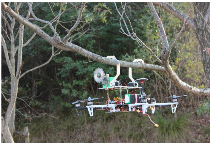
Fig. 4: Yield estimation through drone

Compared to ground spraying, spraying the pesticide with a drone at a height of 3.5 metres results in a higher droplet coverage rate and uniformity on the heated canopy. Approximately 80% of operating time, 90% of water consumption, and 50% of pesticide use can be reduced by using drones to spray pesticides[38].