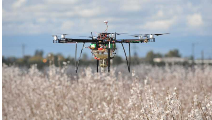
Fig .3 :canopy management through drone

Automated pollinator, a startup out of New York has created a pollen dump drone to aid in the pollination of fruits like apples, cherries, and almonds. They claimed that the drone rate could reach 65% instead of just 25%.