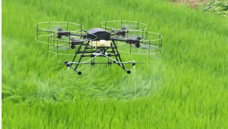
Fig .2 :Pollination assistance through drone