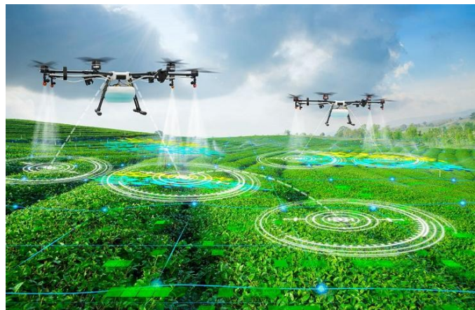
Fig. 1: Water distribution technique

Using a DGPS system, the truck's location was determined. Maps of yield were produced using the data. a less complicated way to gauge the height of the fruit-filled bags. Weighed the workers' filled small plastic bins, which weighed about 20 kg, and used a DGPS system to track their location in order to create yield maps for apples and vines[24].