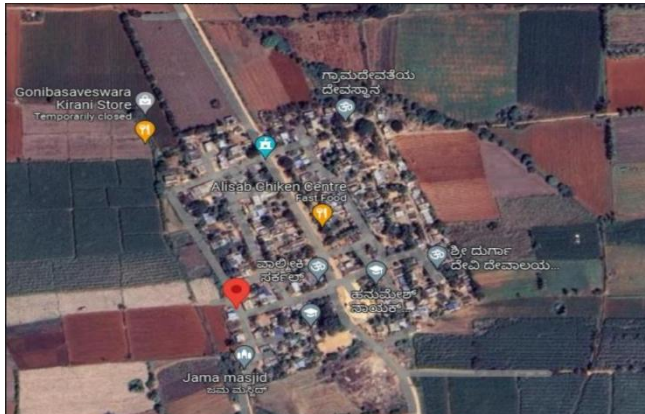
Fig. 1. Google map of HyattiMundaragi village

HyattiMundaragi village in Karnataka, India, is situated in KoppalTaluk of Koppal district. It is positioned 36km away from the district and sub-district headquarters at Koppal. The area of the location is 1952.86 hectares, with coordinates at approximately 15.2670°N latitude and 76.9195°E longitude (Fig. 1), situated at an altitude of 526 meters. It is home to 399 families, comprising a total population of 2,314, with a literacy rate of 61.1% (Table 1).