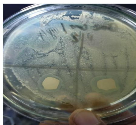
Fig-3 B.cereus zone of inhibition

The activity of inhibition was calculated using the formula: