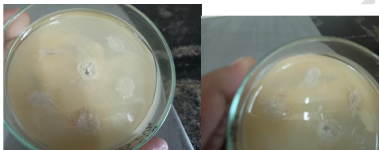
Fig-1 Pikovskaya's agar plating of B.subtilis

Out of the five strains isolated from pure culture obtained from soil samples collected from Rathinapuri,Coimbatore, isolate AMLA5 was found to be potential phosphate solubilizer based upon the clearance zone in Pikovskaya's agar. The bioavailable phosphate was calculated in UV spectrometer at 690nm in ammonium molybdate method.