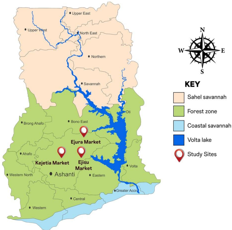
Figure 1: Map of the study area

needs of the local community. Ejusu Market predominantly offers fresh produce, including fruits, vegetables, and grains, sourced from local farmers [23].