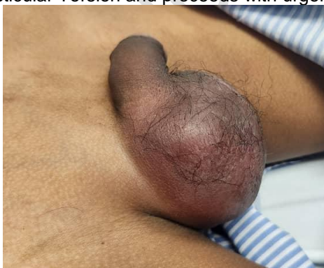
Figure 1 Clinical appearance of Scrotum at ED

Urgent Ultrasonography was performed which shows absence of blood flow to the right testes and hence diagnosed as Right Testicular Torsion and proceeds with urgent referral to the Urology team.