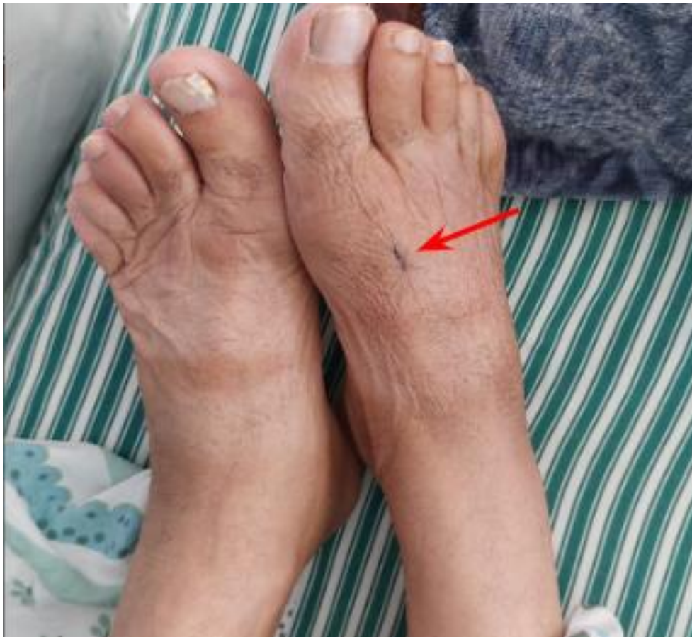
Figure 1. Appearance of the skin lesions."