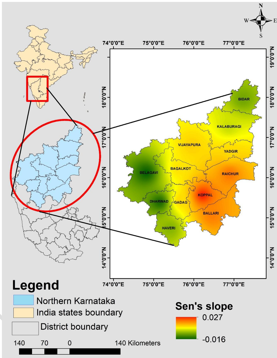
Figure 1. Spatial map of Sen's slope trend magnitude