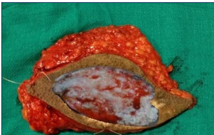
Fig-3 photographs showing wide excision of growth with 2 cm margin