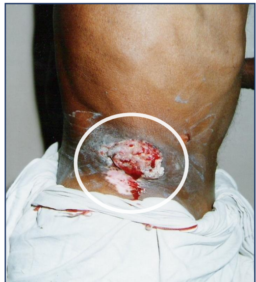
Fig-2 photographs showing ulcerative growth of size 4x3 cm with everted edges