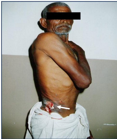
Fig-1 photographs showing ulceroproliferative growth On Right waist

Histopathology reports confirmed the presence of squamous cell carcinoma with tumour-free margins. Postoperatively, the wound healed well without any complications. After a five-year follow-up, no locoregional recurrence was observed. (Fig 1-4)