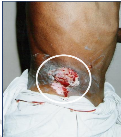
Fig-2 photographs showing ulcerative growth of size 4x3 cm with everted edges