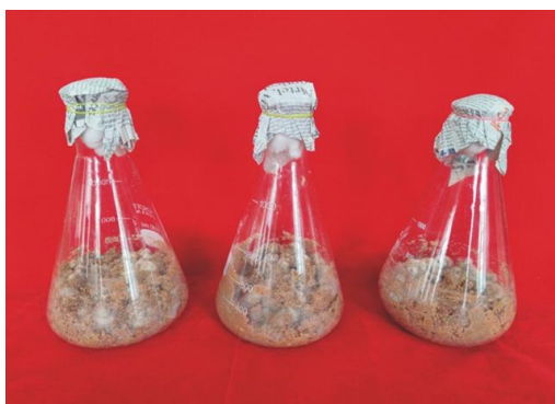
Fig. 4. Rhizoctonia solani Kuhn. culture mass multiplication on maize sand meal (MSM)