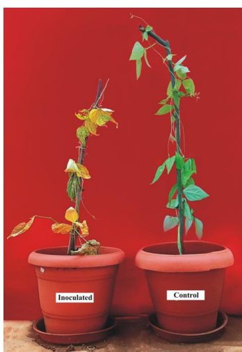
Fig. 5. Pathogenicity assay of Rhizoctonia solani