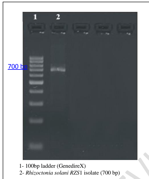
Fig. 2. Gel picture of PCR amplified ITS region of Rhizoctonia solani using the primer pair ITS1/ITS4