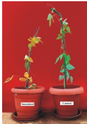
Fig. 5. Pathogenicity assay of Rhizoctonia solani