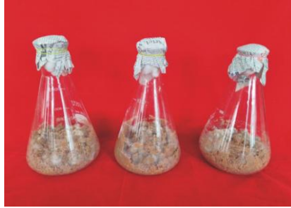
Fig. 4. Rhizoctonia solani Kuhn. culture mass multiplication on maize sand meal (MSM)