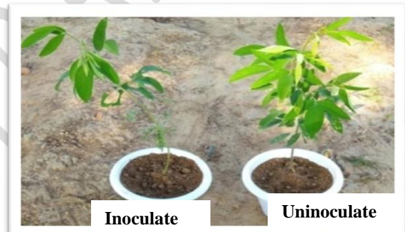
Plate 2. Pathogenicity test on pigeonpea