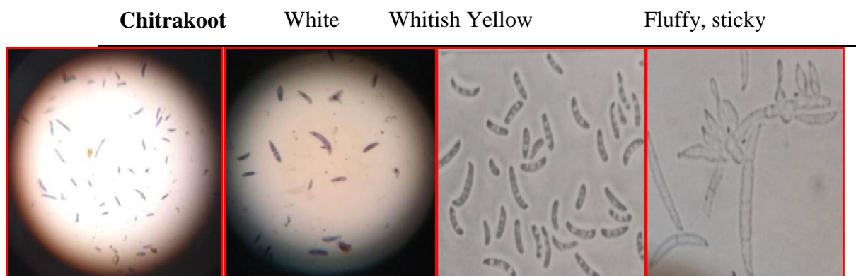
Plate 1. Microscopic view of micro conidia, macro conidia and conidiophores of F. udum

Radial growth- The radial growth of Chitrakoot isolate was maximum on PDA and PSA media consistently on 21 days of inoculation followed by Banda, Hamirpur and Mahoba isolates. Data of the observations were taken after 21 days of inoculation. Chitrakoot isolate showed the highest radial growth i.e 85.33 mm on PDA followed by banda 84.33 mm, Hamirpur 82.33 mm and Mahoba 81.66 mm. The mean of radial growth on PDA and PSA media in Chitrakoot isolate showed highest 84.99 mm followed by Banda 83.99 mm, Hamirpur 82.16 mm and Mahoba 81.33 mm after 21 days of inoculation. Also, the highest radial growth was observed on PDA in case of Chitrakoot isolate while least radial growth was observed on PDA in Mahoba isolates (Table-3). The maximum radial growth was recorded on PSA in Chitrakoot isolate and minimum in Mahoba isolate. The Fusarium udum isolates exhibited high variation in radial mycelial growth and sporulation on PDA. The maximum radial growth was recorded on PSA in Chitrakoot isolate and minimum in Mahoba isolate [12,20,23]