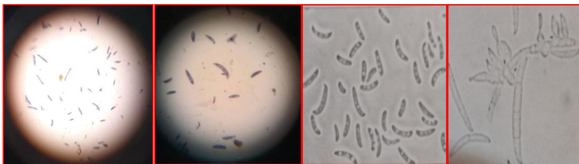
Plate 1. Microscopic view of micro conidia, macro conidia and conidiophores of F. udum

Radial growth- The radial growth of Chitrakoot isolate was maximum on PDA and PSA media consistently on 21 days of inoculation followed by Banda, Hamirpur and Mahoba isolates. Data of the observations were taken after 21 days of inoculation. Chitrakoot isolate showed the highest radial growth i.e 85.33 mm on PDA followed by banda 84.33 mm, Hamirpur 82.33 mm and Mahoba 81.66 mm. The mean of radial growth on PDA and PSA media in Chitrakoot isolate showed highest 84.99 mm followed by Banda 83.99 mm, Hamirpur 82.16 mm and Mahoba 81.33 mm after 21 days of inoculation. Also, the highest radial growth was observed on PDA in case of Chitrakoot isolate while least radial growth was observed on PDA in Mahoba isolates (Table-3). The maximum radial growth was recorded on PSA in Chitrakoot isolate and minimum in Mahoba isolate. The Fusarium udum isolates exhibited high variation in radial mycelial growth and sporulation on PDA. The maximum radial growth was recorded on PSA in Chitrakoot isolate and minimum in Mahoba isolate [12,20,23]