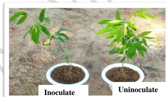
Plate 2. Pathogenicity test on pigeonpea