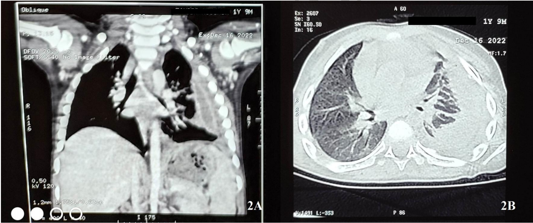
FIGURE 2: HRCT thorax yielding left sided large pleural effusion with sub pleural collapse with fibrous septations without any mediastinal shift.