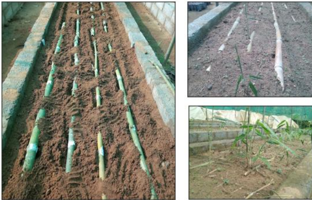
Fig. 2. Planting of D. brandisi cuttings in sand bed for propagation

3.1.1 Propagation through cuttings: Rooting can be induced in culm (Figure 2), branch, and nodal cuttings. Planting two nodal cuttings in suitable media and conditions, with one node exposed outside and another inside the media [6, 7, 8]. To prevent fungal attacks, the upper portion of the cutting is covered with Parafilm. Additionally, the choice of growth regulators, treatment method, collection time of cuttings, and the culm part (base, middle, or top) are critical factors influencing the process across different species.