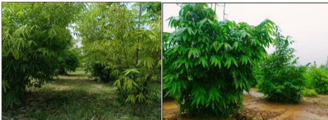
Fig. 1. Plantation of D. brandisii

documented in previous reports[2]. Histochemical and biochemical examinations of bamboo culms reveal a reduction in starch content in D. brandisii culms following flowering [3]. The distinctive qualities of Burma bamboo, which set it apart from many local bamboo kinds, are its sizeable size, straight growth pattern, and, most importantly, its lack of thorns.