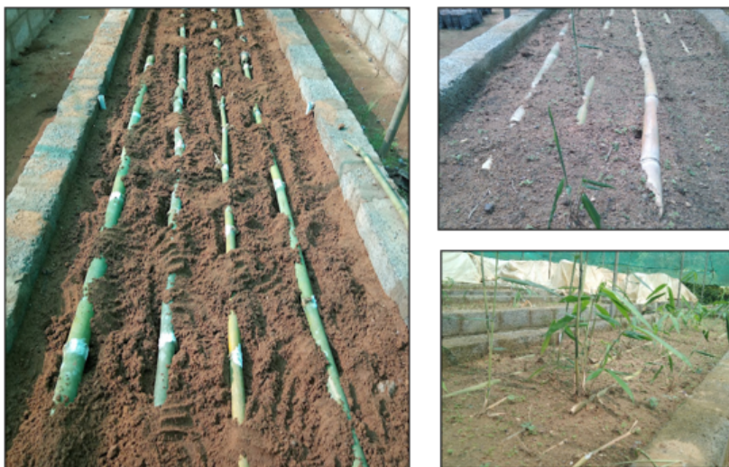
Fig. 2. Planting of D. brandisii cuttings in sand bed for propagation

3.1.1 Propagation through cuttings: Rooting can be induced in culm (Figure 2), branch, and nodal cuttings. Planting two nodal cuttings in suitable media and conditions, with one node exposed outside and another inside the media [5, 6, 7]. To prevent fungal attacks, the upper portion of the cutting is covered with Parafilm. Additionally, the choice of growth regulators, treatment method, collection time of cuttings, and the culm part (base, middle, or top) are critical factors influencing the process across different species.