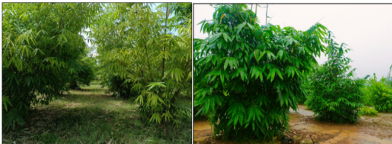
Fig. 1. Plantation of D. brandisii

instance of collective flowering in Kodagu was observed between 2010 and 2012, as documented in previous reports. [2]. Histochemical and biochemical examinations of bamboo culms reveal a reduction in starch content in D. brandisii culms following flowering [3]. The distinctive qualities of Burma bamboo, which set it apart from many local bamboo kinds, are its sizeable size, straight growth pattern, and, most importantly, its lack of thorns.