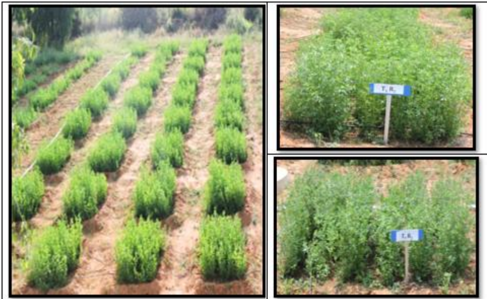
Fig 3: Flowering initiation stage