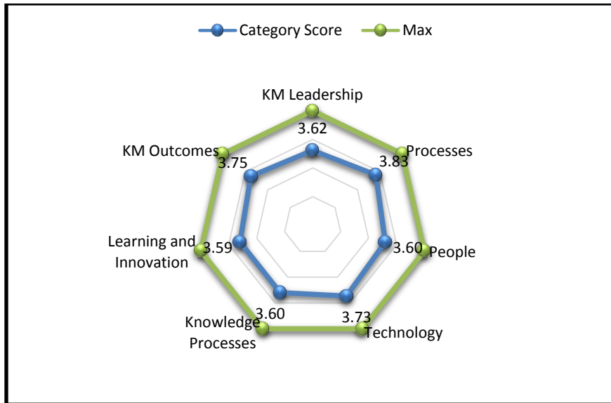
Figure 1. KM Assessment Radar Chart

According to figure 1, the highest category is "Processes" and the lowest category is "learning and innovation" with a value of 3.59. Both technology and KM outcomes have an average score of 3.7. This concludes that steel fabricators in Indonesia are quite focused on achieving higher productivity, profitability, quality, and customer satisfaction through reduced cycle time, bigger cost savings, enhanced effectiveness, and more efficient use of resources. Technology also plays a role in facilitating knowledge collaboration and accessibility of knowledge through all organizations. The highest values of indicators are in the processes category, which "The organization periodically evaluates and improves work processes to improve performance, improve products and services in line with business trends". The lowest values of indicators are in the Learning and Innovation category, which "individuals are given incentives to cooperate and share information".