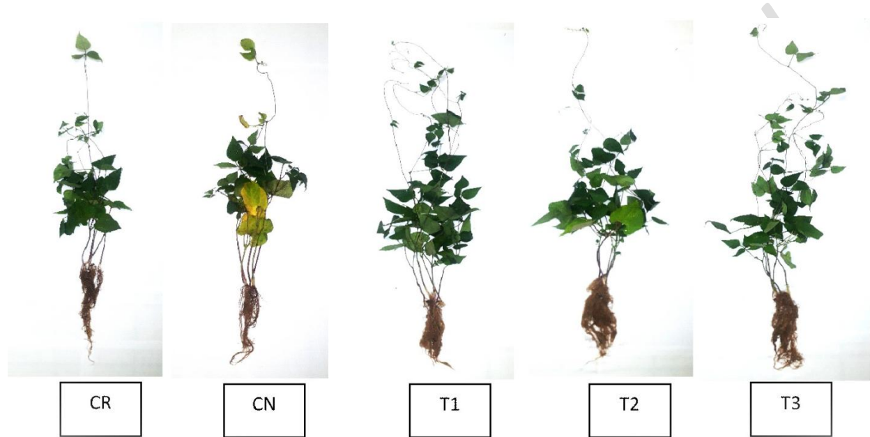
Figure 3. Phenology of Phaseolus vulgaris enhanced with Methylobacterium symbioticum and Xanthobacter autotrophicus at pre-flowering in the phytoremediation of soil polluted by 3000 ppm of waste motor oil (WMO).

RC (relative control): P. vulgaris uninoculated with M. symbioticum and X. autotrophicus fed with 100% mineral solution in soil no polluted WMO. NC (negative control): P. vulgaris uninoculated with M. symbioticum and X. autotrophicus uninoculated, irrigated with water in soil polluted by 38,204 ppm WMO (negative control), T1 (treatment 1): P. vulgaris with X. autotrophicus fed with 50% mineral solution in soil polluted by WMO remaining from biostimulation. T2(treatment 2): P. vulgaris with M. symbioticum fed with 50% mineral solution in soil polluted by WMO remaining from biostimulation. T3(treatment 3): P. vulgaris with M. symbioticum and X. autotrophicus fed with 50% mineral solution in soil polluted by WMO remaining from biostimulation.