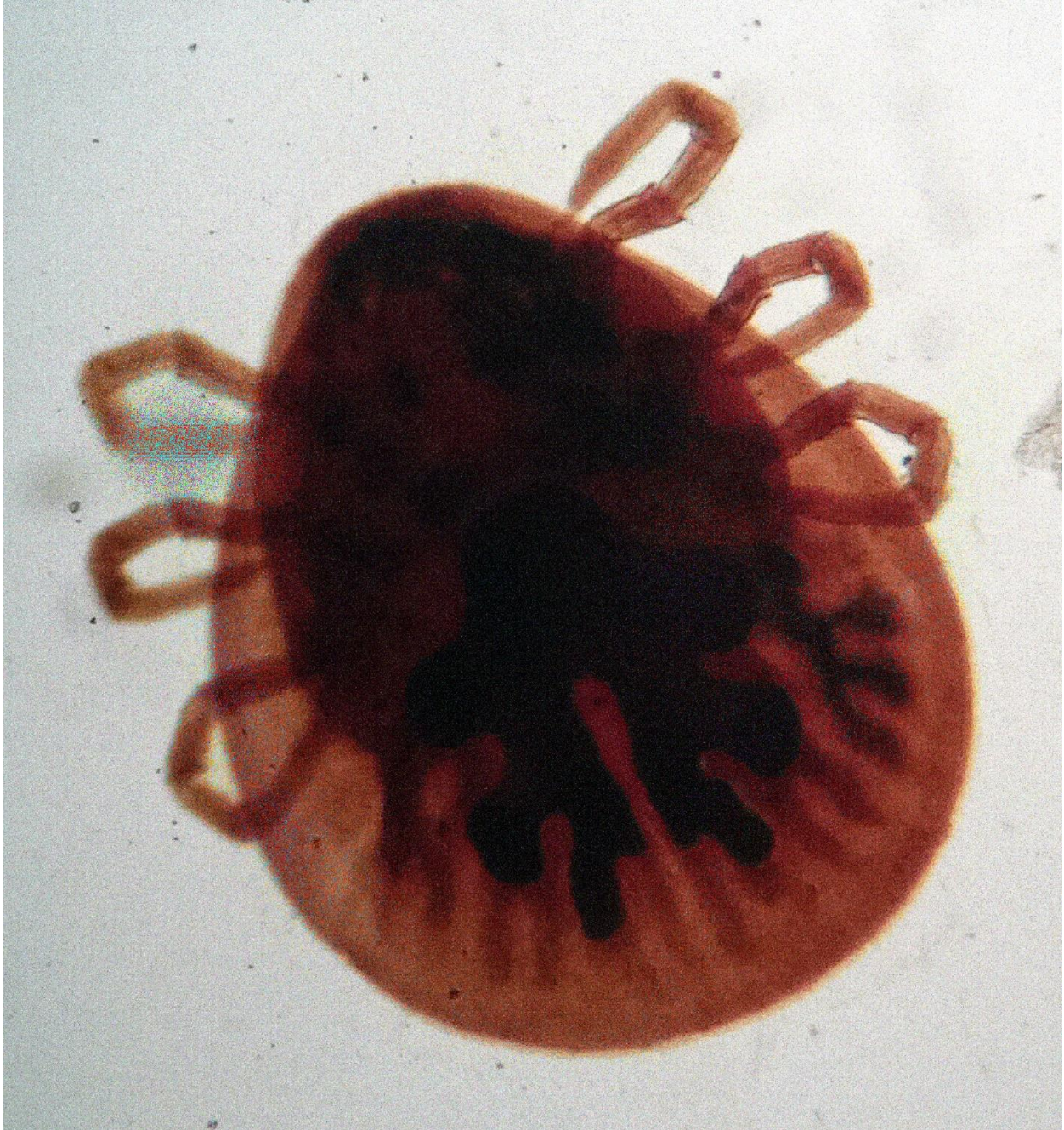
Figure.2: Argas persicus : Dorsal view at 10x objective Stereomicroscope