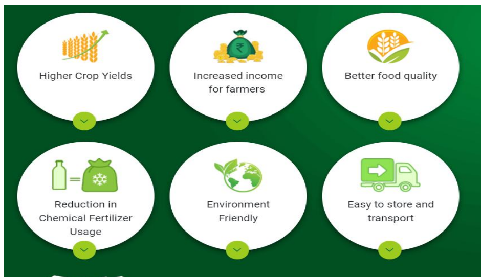
Fig. 2. Benefits of Nano urea

potential benefits, there may be limited long-term research on the effects of nano urea on crop yields, soil health, and overall agricultural sustainability. More extensive research is needed to fully understand its implications.