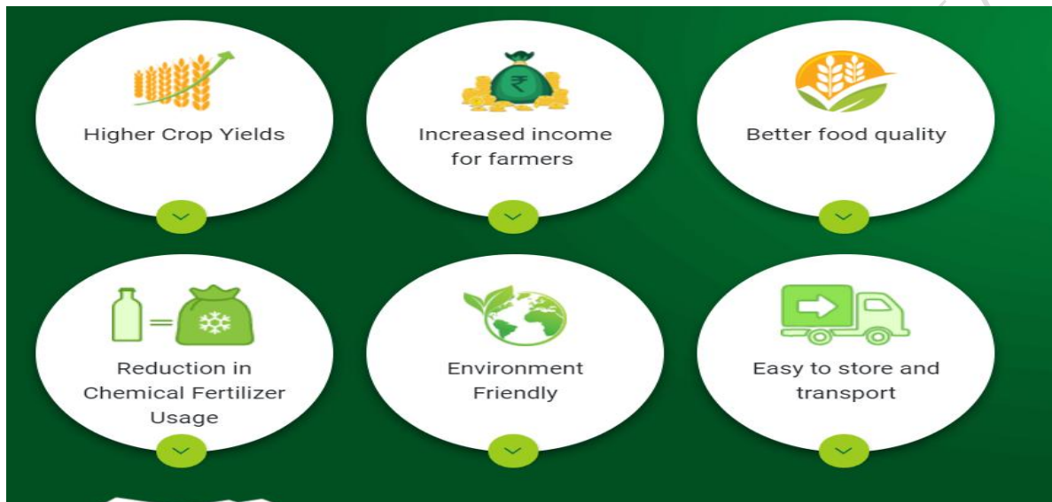
Fig. 2. Benefits of Nano urea

and Sustainable Agriculture: Crops cultivated with Nano-urea are safe for consumption, showcasing enhanced food quality. The nanotechnology facilitates metabolic assimilation of nutrients, resulting in produce with increased protein and nutrient content. Nano Urea adoption promotes sustainable agriculture, ensuring optimal crop yield and soil health, reinforcing its positive impact on both food safety and nutritional value.