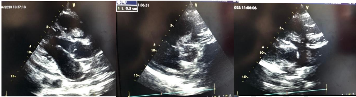
Figure 1: Transthoracic echocardiography showed an enormous vegetation measuring 35 x33 mm inserted on the perimembranous ventricular septal defect extended through the pulmonary infundibulum to the main pulmonary artery during systole

of appropriate antibiotic therapy, she had persistent fever with rising CRP, repeated a CT scan of the thorax demonstrated multiple septic pulmonary emboli. Therefore, in consensus with our endocarditis team, including a cardiac surgery evaluation, and given the hemodynamic and embolic risk, we decided to perform surgical treatment, segmentectomy, VSD patch closure and tricuspid valve plasty depending on surgical exploration. The patient's postoperative course was uneventful and he was discharged 2 weeks after surgery.