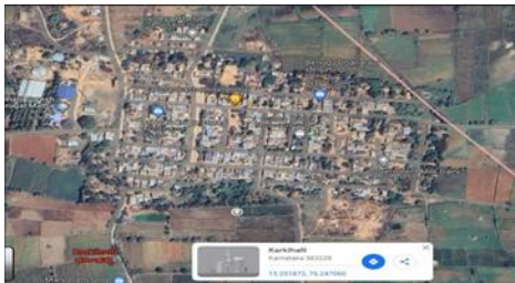
Table 1. Demography of Karkihallivillage

Karkihalli village, located in Karnataka, India, is assigned the village location code 601786. It is situated in the Koppal taluk of Koppal District, approximately 19 kilometers to the north of the district headquarters, Koppal. The village covers a total geographical area of 4636.13 hectares, positioned at coordinates 15.251872°N Latitude and 76.247060°E Longitude (as depicted in Figure 1.0 and Table 1). Karkihalli village is home to a population of 2,428 individuals, with 1,221 being male and 1,207 being female. The literacy rate in Karkihalli village stands at 49.59%, with 59.54% of males and 39.52% of females being literate. The village comprises approximately 407 households, and its postal code is 583238.