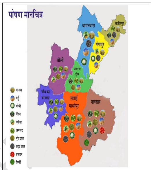
Fig 1. Map showing study location

vegetable grown in homestead, homestead vegetable utilization, average vegetable consumption, nutrient contribution from homestead vegetable gardening were planned and undertaken. Pre-survey was conducted to obtain information regarding profile and respondent’s dietary food habits and nutritional deficiency diseases were also pre-surveyed. After one year of establishment of nutritional garden, a post-survey was done to analyse the impact of kitchen gardens on nutritional status of selected families. Data were collected by interview schedule. Map of Sawai Madhopur shows production and productivity of major recipes.