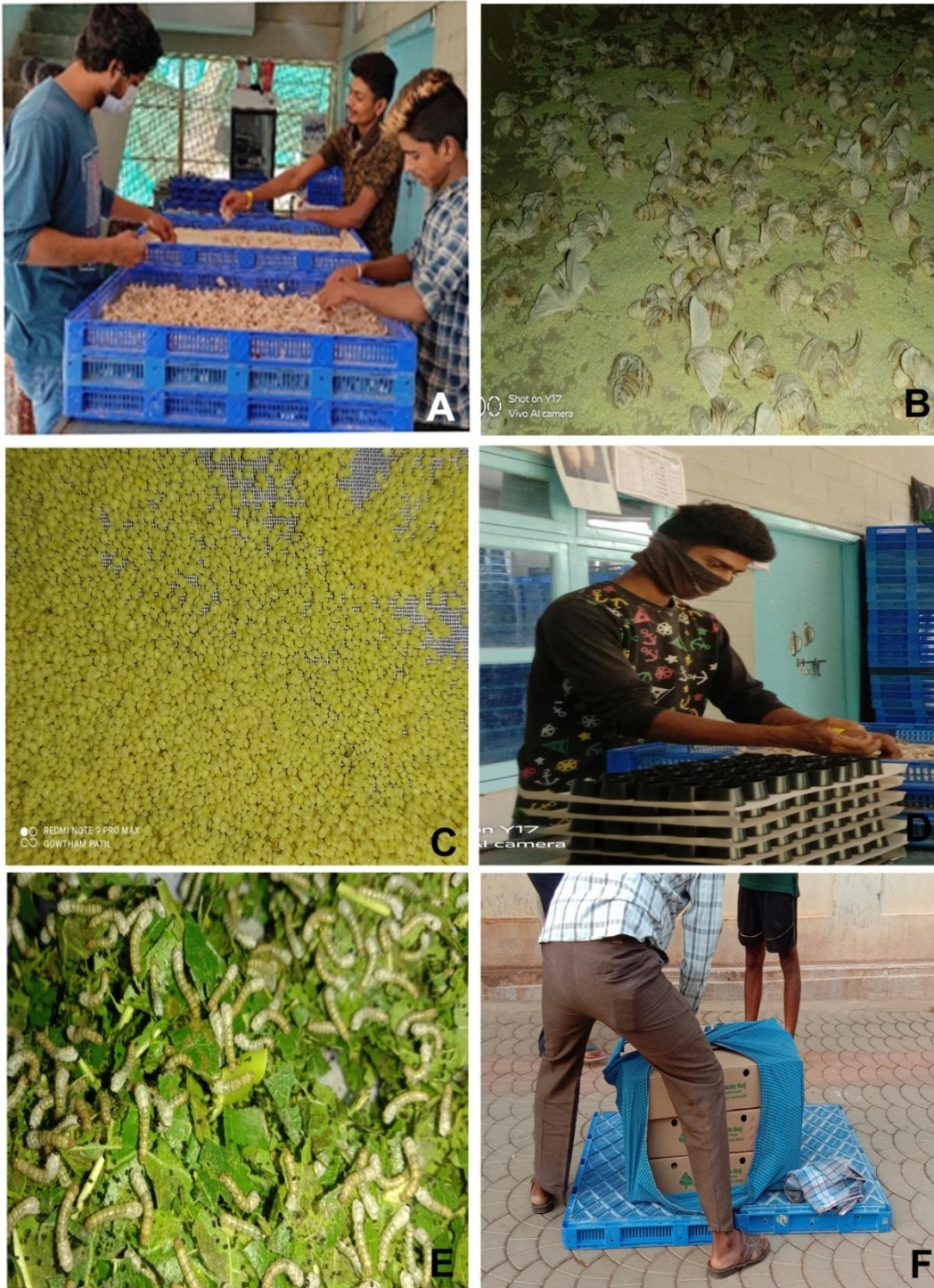
Figure 3: Preparation of disease free layings and distribution of chawki worms to farmers. (A. De-pairing of moths, B. Egg laying, C. Loose eggs, D. Oviposition for the laying of poly hybrid layings, E. Chawki worms, F. Distribution of chawki worms to farmers).