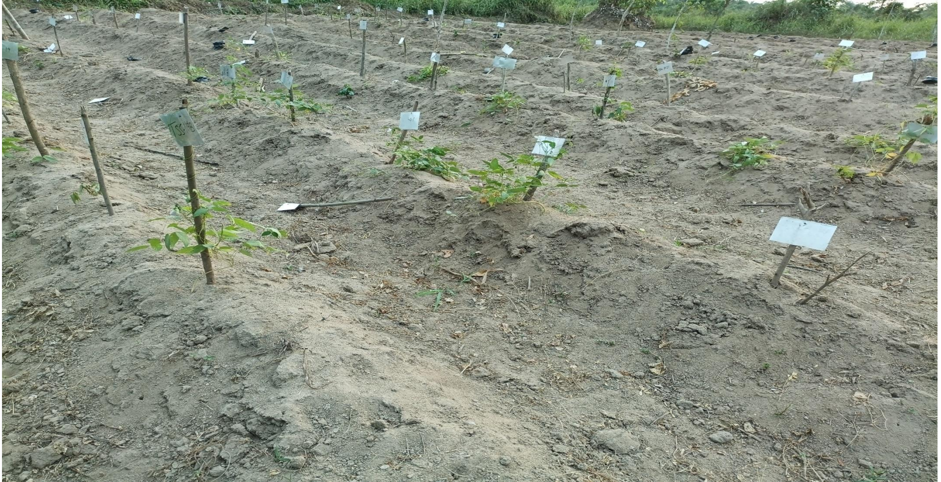
Plate 1: The experiment was laid out in a Randomized Complete Block Design (RCBD) with five (5) replicates.