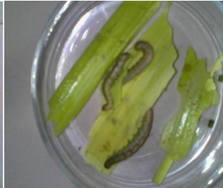
Larva of FAW