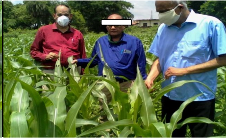
Visit of Farm Committee