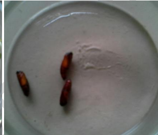
Pupa of FAW