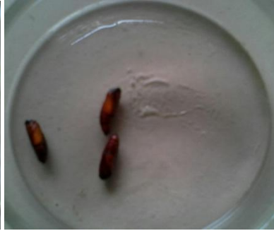
Pupa of FAW

Plate 1 :Culture of Spodoptera frugiperda and observation of damage in maize crop