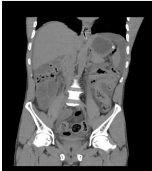
Figure 2. Non-contrast computed tomography showing pneumoperitoneum due to hollow viscus perforation, along with proctitis, sigmoid colitis, and enteritis

Therapeutic Intervention: The patient received liberal fluid resuscitation and intravenous broad-spectrum antibiotics. Nasogastric aspiration yielded 100 cc of fecal material. Emergency exploratory laparotomy was performed after the site of perforation was not identified on radiological investigations. During the procedure, an 8cm full-thickness longitudinal tear was discovered on the rectosigmoid junction, with oedematous and dilated bowel loops proximal to it (Figure 3). No evidence of mass, fat wrapping, nodularity, or gangrenous intestinal changes was present. Primary repair of the sigmoid colon perforation was performed, and a diversion loop ileostomy was created.