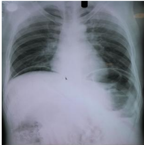
Figure 1. Chest X-ray indicating gas under the right diaphragm

Clinical Findings: Upon examination, the patient was conscious but febrile (temperature 101°F), with a pulse rate of 130 beats/minute, respiratory rate of 31 cycles/minute, and a blood pressure of 102/68 mmHg. Abdominal examination revealed mild distension, rigidity, and diffuse tenderness, with absent bowel sounds, suggesting perforation peritonitis. Per rectal examination showed a dilated rectum with bloody mucous discharge. A chest X-ray indicated gas under the right diaphragm. Abdominal ultrasound revealed peritonitis with pyoperitoneum (Figure 1).