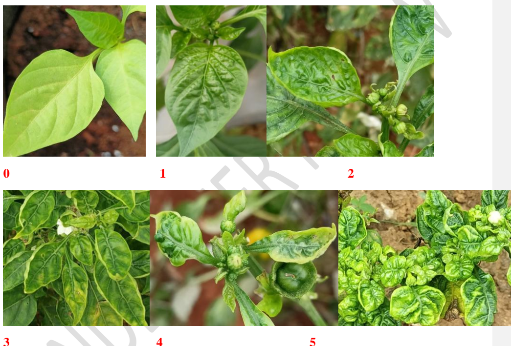
Plate 1: Disease rating scale for virus disease in capsicum