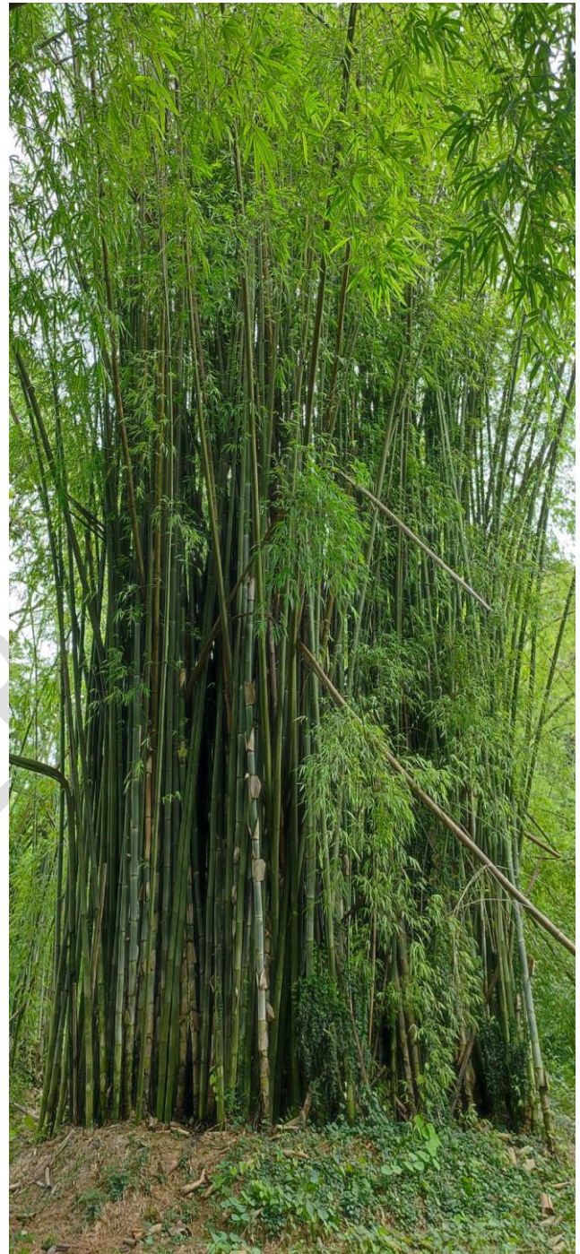
Fig2: Bamboo clump being grown at Bambusetum FRI Campus Dehradun.

Bamboos can clean up polluted soils and collect silicon in their bodies to alleviate metal toxicity, with a natural buildup of up to 183 \text{ mg}\cdot\text{g}_1 \text{ SiO}_2 [21]. The results of a two-year experiment on the efficacy of three bamboo species for wastewater removal revealed that the soil-bamboo system could remove 98 percent of organic matter and 99 percent of nutrients, respectively [22]. As a result, bamboo is an excellent choice for reducing the negative effects of climate change, as well as a large carbon sink in nature that aids in the adjustment and improvement of human ecosystems[23].