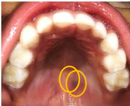
Fig 2: Pre-Operative image