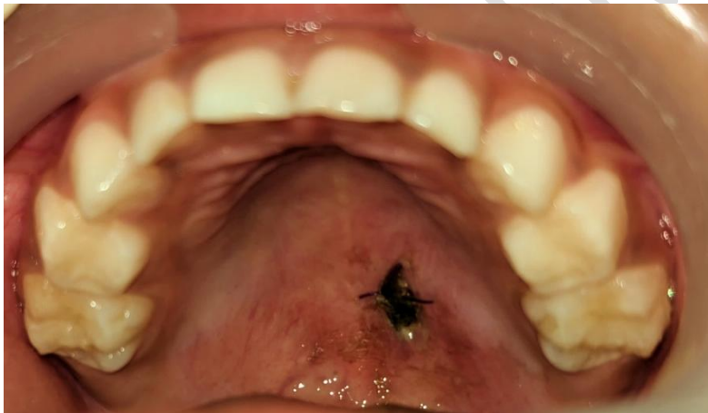
Fig 7: Post-Operative Follow Up (Day 2)