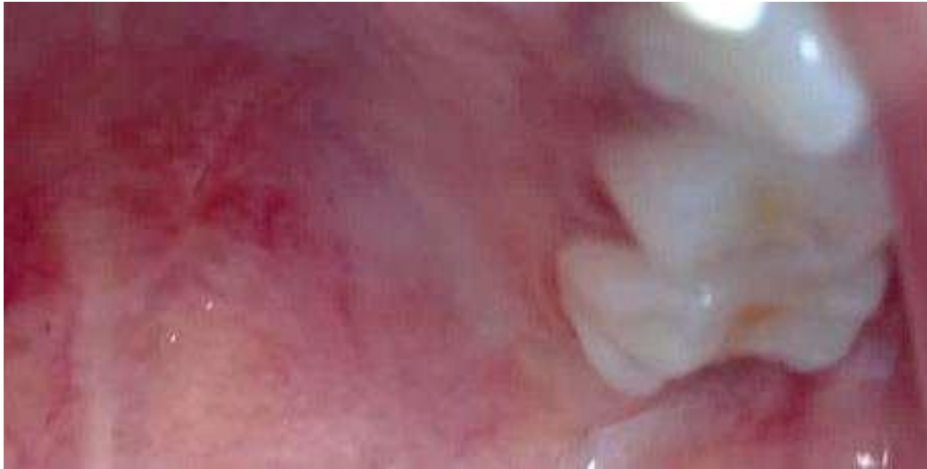
Fig 9: Post-Operative Follow Up (6 months)