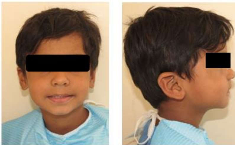
Fig 1 :Extra-Oral image