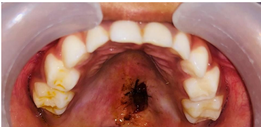
Fig 4 :Suture in the teeth