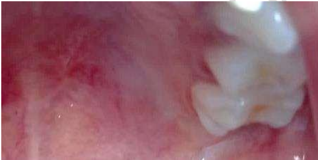
Fig 9 : Post-Operative Follow Up (6 months)