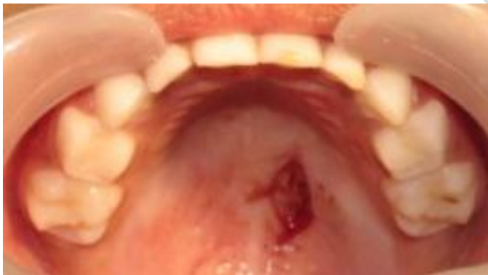
Fig 3 :Incision in the teeth