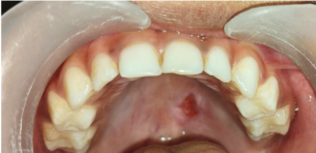
Fig 8 :Post-Operative Follow Up (1 week)