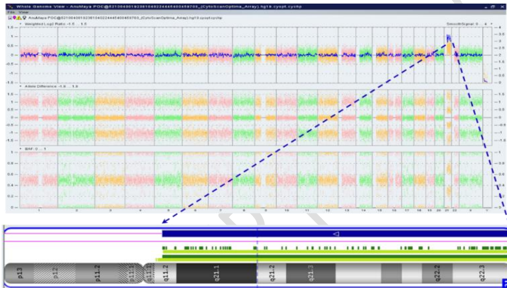
Figure 2: ChAS suite karyoview and IGV profile showing T21 in case I (neonate) (47, XY,+21), gain ▲

In case I, the reason for trisomy, might be advanced maternal age which is the most common factor influencing the disjunction of chromosomes leading to T21. However, In the second case, T21 is suspected to be the pre-eminent cause of fetal demise. The patient also had a clinical history of recurrent miscarriages. The couple was not made aware of genetic testing or prenatal screening with a lack of proper follow-up until the subsequent miscarriage.